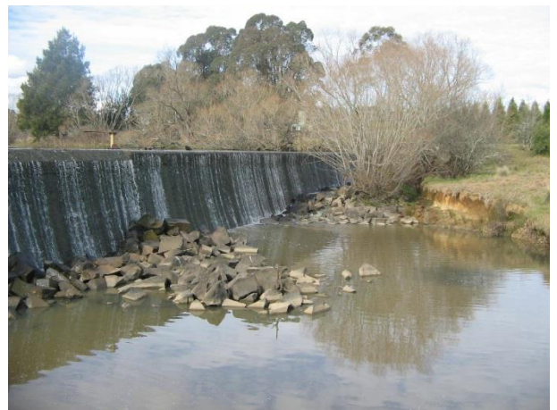
Bong Bong Weir

We are asking for information such as photos and observations of flooding behaviour. In particular, information on observed peak flood levels is most important. This is where we need your help.