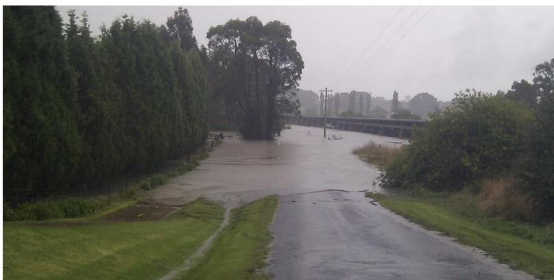
Railway Bridge at Railway Road, Burradoo

(Australian Rainfall and Runoff) have recently been updated, incorporating approximately 30 years of additional data and revised procedures. These guidelines and best practice computer flood modelling techniques will be used in this study to provide an improved and more comprehensive assessment of flood behaviour.